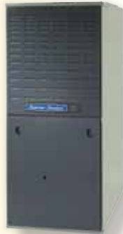
Gold SM Freedom® 80 Two-Stage